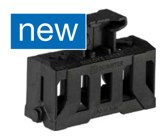
ESO Fuse Inserter/Extractor (part of the delivery) Order required accessories separately

Fuse Inserter/Extractor with Cover Function for 10.3x38 mm Fuses in Clips, Patent Pending