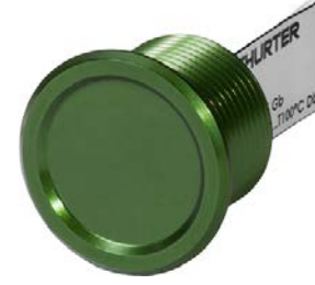
PSE 16 EX